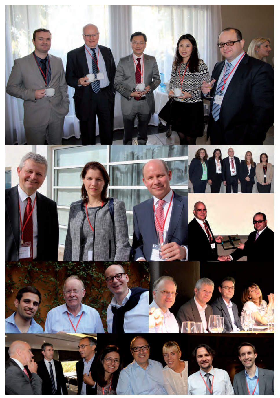
Annual General Meeting, Cyprus January 2015 & Half-Year General Meeting, Barcelona June 2015